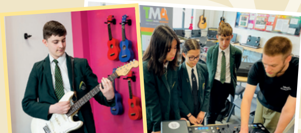
TRINITY MUSIC ACADEMY