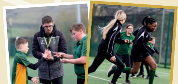
SPORTS LEADERSHIP SPORTS ACADEMY